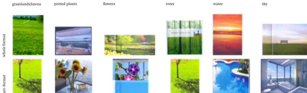
Figure 3: The forms in which Natural elements appear in the brochures

Nature conveyed through both photographic images and graphical renderings in the form of: (1) Vegetation, (2) Water, and (3) Sky, offer more insights. As vegetation it makes its appearance through the following elements: (a) lawns/grasslands, (b) potted plants, (c) flowers, and (d)