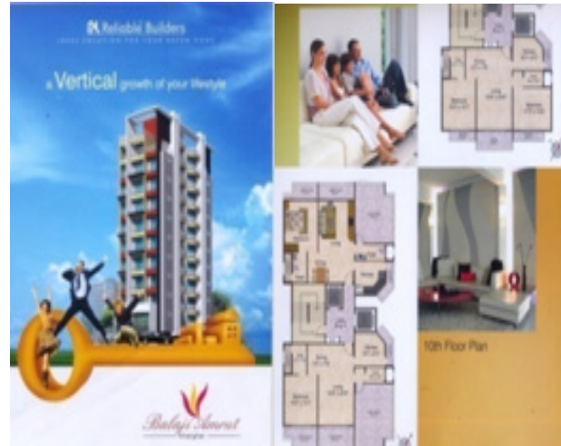
Figure 1: The private housing brochure and its contents

for residential projects through bookings from prospective inhabitants. For this purpose, not only does it describe the house, but also happens to communicate intangible aspects concerned with the ‘feel’ of the home. This dual aspect takes the form of: the functional description (represented by technical drawings like plans) and the conceptualization of the home (represented by general images involving people and the tag-lines).