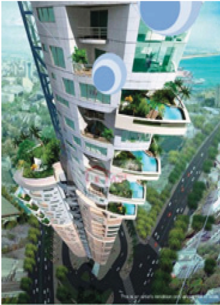
Figure 6: Artists rendition of Sky-villas in Unitech Developers, 'Unitech Grande-Noida', Noida 10

domesticity. They point towards a very non-urban place. The disposition of the leisurely activities in nature towards holiday and vacation, reinforce the tendency of representations of nature (as spectacular and as something to be lived close to) to point to places outside the city. This projected landscape appears on the one hand as exotic and on the other as well-managed. This combination of both the exotic and