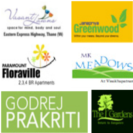
Figure 2: Along with the name, the home-logo indicates the presence of natural elements

Nature conveyed through both photographic images and graphical renderings in the form of: (1) Vegetation, (2) Water, and (3) Sky, offer more insights. As vegetation it makes its appearance through the following elements: (a) lawns/grasslands, (b) potted plants, (c) flowers, and (d)