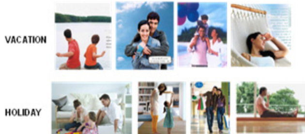
Figure 5: Leisurely activities and setting as part of nature are expressions which tend to evoke vacations

interior-room, to be incorporated into the intimate texture of home-life.